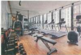
ON level 12, the 24-hour state-of-the-art gym provides a serene setting for guests to work out and recharge.