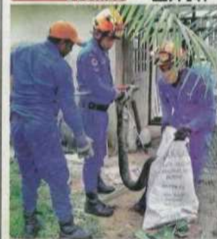
Three-metre long python caught in Kua Millie > P2