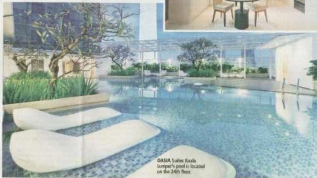
OASIA Suites Kuala Lumpur's pool is located on the 24th floor.

A unique feature offered by Oasia Suites Kuala Lumpur is the dual-key access system. This feature enables groups of guests to stay in one unit that can be divid-