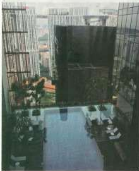
THE Club infinity pool with unparallel views of the city.