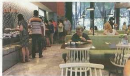
THE Marmalade Party offers healthier options, available round-the-clock.

Located at the lobby level 1, food guests can enjoy all-day dining at The Marmalade Party, a well-known restaurant chain spe-