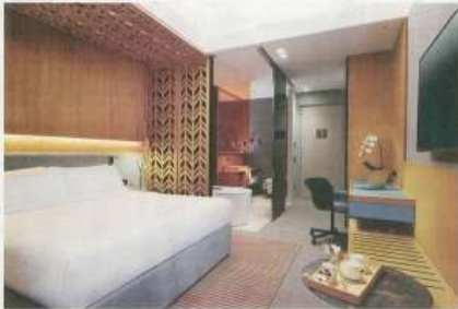
THE hotel's Club Room.