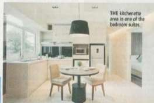
THE kitchenette area in one of the bedroom suites.

The hotel is located in the Golden Triangle of Kuala Lumpur. Oasia is an easy access to the city's key business infrastructure. The hotel offers guests an ideal respite within the city with views of both skyscrapers and also sprawling greenery as it is located adjacent to the KL Forest Eco Park. So wait no more and be one of the first to experience Oasia Suites Kuala Lumpur for yourself.