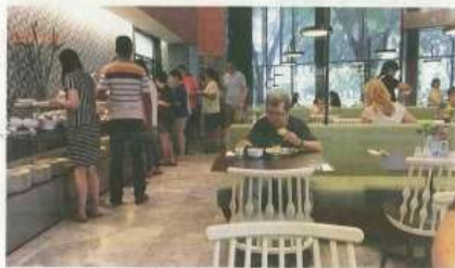
THE Marmalade Party offers healthier options, available round-the-clock.

Located at the lobby level 1, food guests can enjoy all-day dining at The Marmalade Party, a well-known restaurant chain spe-