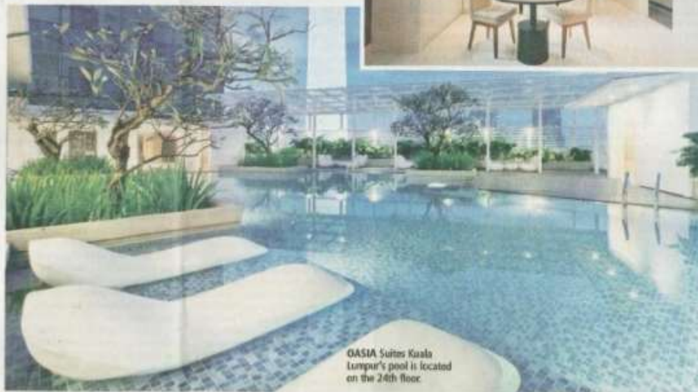
OASIA Suites Kuala Lumpur's pool is located on the 24th floor.

A unique feature offered by Oasia Suites Kuala Lumpur is the dual-key access system. This feature enables groups of guests to stay in one unit that can be divid-