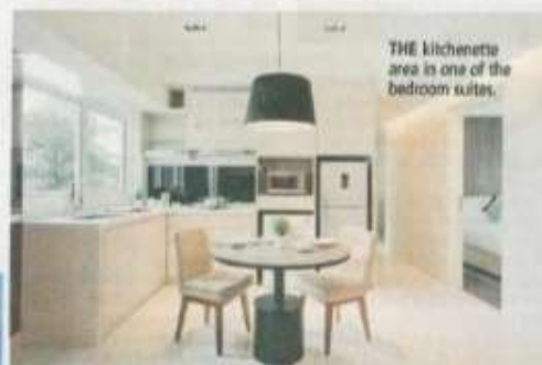
THE kitchenette area in one of the bedroom suites.

The hotel is located in the Golden Triangle of Kuala Lumpur. Oasia is an easy access to the city's key business infrastructure. The hotel offers guests an ideal respite within the city with views of both skyscrapers and also sprawling greenery as it is located adjacent to the KL Forest Eco Park. So wait no more and be one of the first to experience Oasia Suites Kuala Lumpur for yourself.