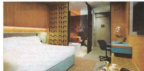
The Club Room.