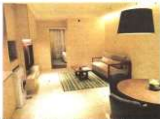
The outer room of the one-bedroom Premier Room.

This hotel caters for families and corporate people who just want a place to stay in the city but away from the crowd. The hotel also provides multi-story parking.