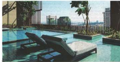
Grab a book and relax by the infinity pool.