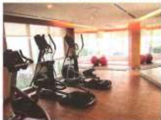
The 24-hour gymnasium overlooks the city.