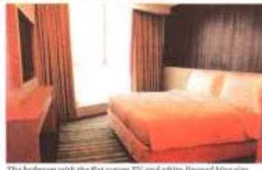
The bedroom with the flat screen TV and white-themed king size bed.