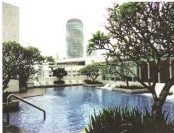
The rooftop pool on the 24th floor boasts a view of the city.