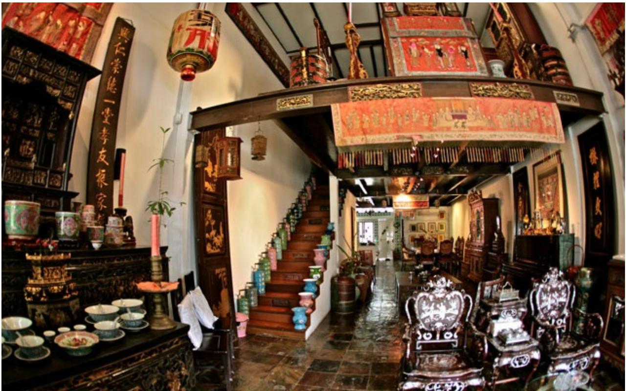
Private Peranakan museum The Intan offers tailored tours for Raffles Hotel Singapore’s guests