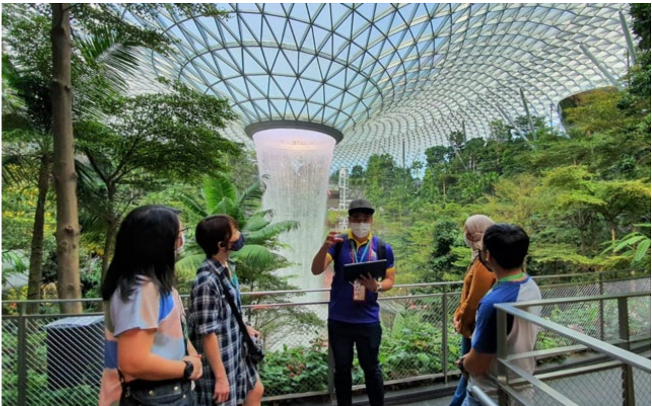
A guide from Monster Day Tours bringing guests on a two-hour walking tour around Changi Airport and Jewel, as part of the agency's collaboration with the airport

There is strength in unity, as the old adage goes. And that saying has never rang truer than for a tourism industry fighting to rise from the pandemic's ashes.