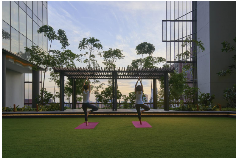
Oasia Hotel Downtown in Tanjong Pagar has a weekend staycation package that includes high tea and a one-hour fitness class.

With all that pent-up wanderlust, perhaps it is time for a staycation in one of many local hotels offering attractive deals and activities beyond the standard room and breakfast.