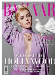
Harper's BAZAAR Singapore