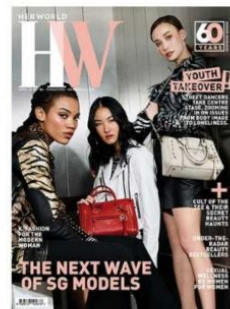
Her World Singapore