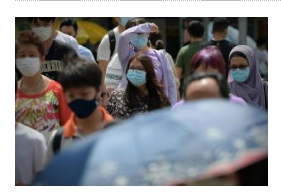
12 new Covid-19 cases in Singapore, including 2 in the community and 6 imported cases