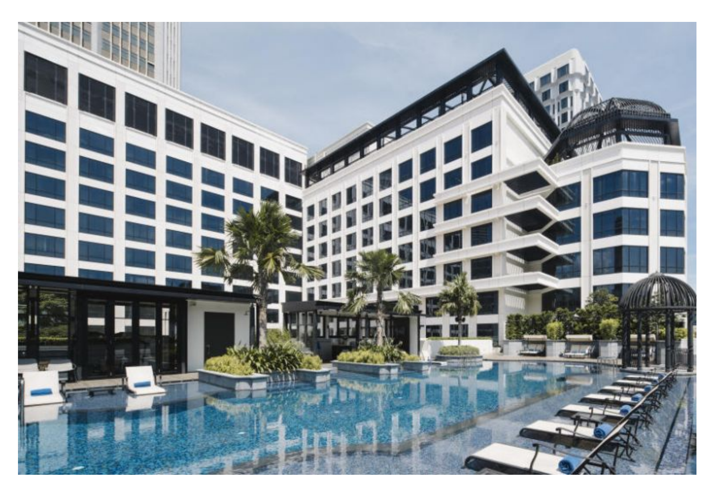
Grand Park City Hall will provide free accommodation in guest rooms for its Malaysian employees.