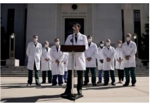
Next 48 hours critical for Trump's care, source says; but doctors say Trump 'doing very well'