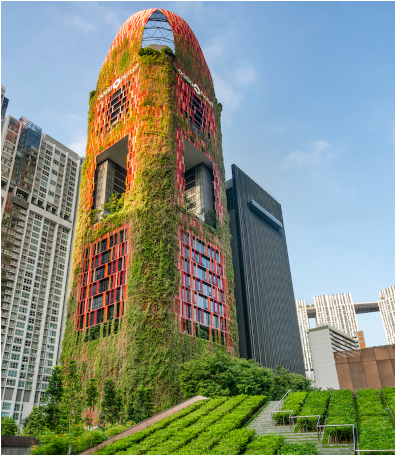
Photo: Oasia Hotel Downtown, Singapore

Acting as a giant trellis for the creepers is an aluminium mesh cladding in five warm tones of red, orange and pink which creates a striking contrast to the green foliage and also brings a vibrant mosaic of colour and life to the 27-storey hotel.