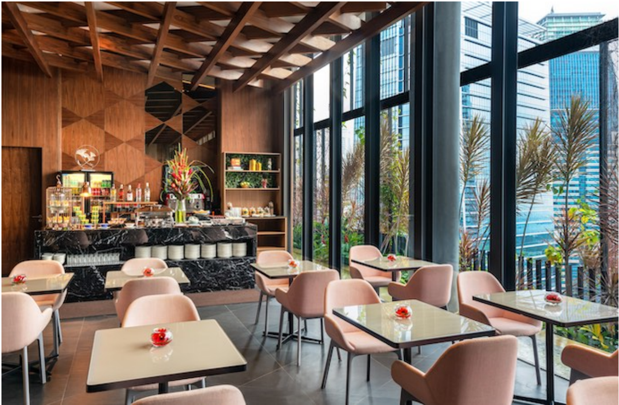
Club Lounge on Level 21

Get your vitamin boost from the fresh pineapple, melon and watermelon in the fruit bowl, and your choice of orange, apple, cranberry or lime juice.