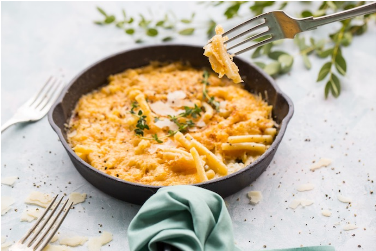
The Marmalade Mac & Cheese

For lunch and dinner, the homegrown bistro offers signature comfort fare such as The Marmalade Mac & Cheese, Spicy Crabmeat Pasta, Grilled Salmon and Roasted Potatoes, Spicy Sriracha Chicken Burger, Kimchi Fried Rice and Sticky Date & Toffee Pudding.